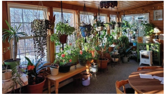
Amy's Sunroom - Houseplant Basics

Find us on FACEBOOK! RSU 16 Adult Education