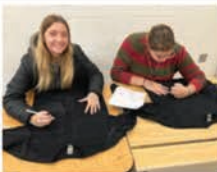
Anatomy and Physiology students creating t-shirts to help with learning.

PRHS invites the RSU 16 community to visit the high school for our extra-curricular band and chorus concerts, theater productions, and sporting events. Past graduates and community members are also invited to attend alumni day, celebrations of learning, and the graduation ceremony.