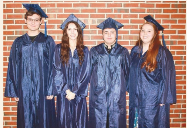
Four of our nine 2023 graduates

Similar to the GED®, the HiSET® exam gives adults the opportunity to demonstrate they have knowledge equivalent to that of a high school graduate. Preparation classes, predictor tests and exams are free for those 17 or older. Successful completion of all official exams results in a HiSET® credential issued by the State of Maine. Accommodations are available for persons with documented disabilities per Americans with Disabilities Act.